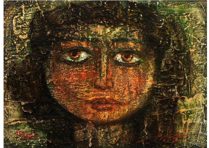
Nazir Nabaa 1969